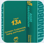
ASM Handbooks Center

ONLINE DATABASES OF MATERIALS RESEARCH AND DATA