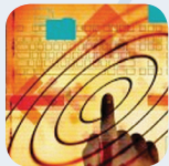
ASM Alloy Center