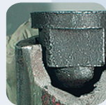
ASM Failure Analysis Center